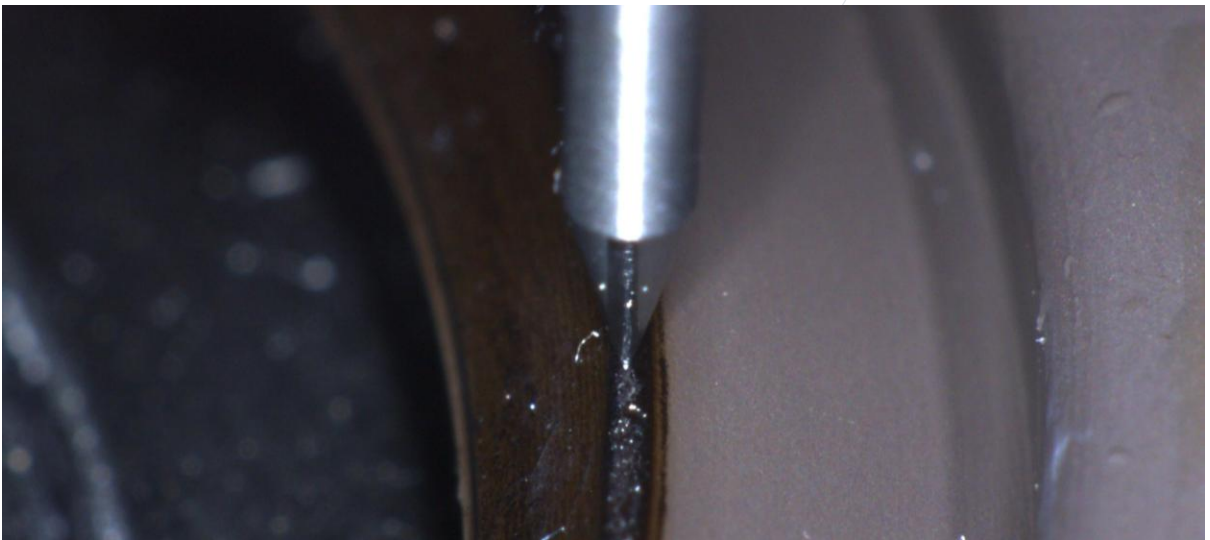
Indentation Measurement on a FKM Radial Shaft Seal

As of now, every radial shaft seal analyzed by OPR undergoes both conventional manual evaluation and micro-indentation analysis. This dual approach not only ensures maximum accuracy but also supports the gradual transition toward a fully automated, data-driven quality assurance process.